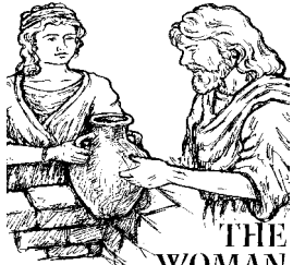
THE WOMAN AT THE WELL

In hindsight, I see the start of the miracle beginning the moment I was sentenced to prison.